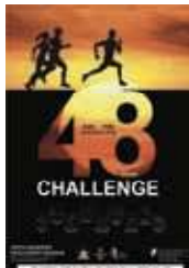
Recent Artwork 48 hrs Challenge (SIWEC-MNDF 2016)

Change your life Campaign (2010) | HIV/Aids Prevention Campaign (UNDP 2011) | MOTC (Maldives investment forum 2014) Booklet and Video Presentation | Tourism Reaches Youth (UNDP / MOT 2013) | Alternative Education Campaign (UNICEF / MOE 2015) | 48 hrs Challenge (SIWEC-MNDF 2016)