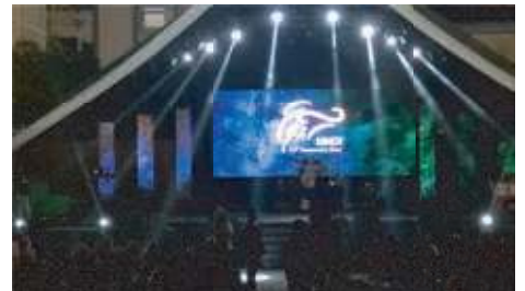
MNDF Synchronised Drill Display - independence day 2019